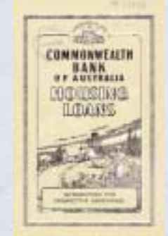
Top: Australian War Memorial: Accession ARTV01062 Middle: Australian Women's Weekly , 14 February 1942. Bottom: Battye Library: PR3241/1