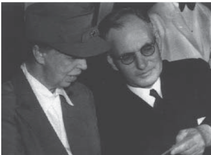
One of the photographs donated by the Western Australian Newspapers featuring John Curtin with Eleanor Roosevelt

Over the past twelve months JCPML staff have been active in identifying John Curtin-related material located in newspaper archives around the country. Several substantial donations have been made to the JCPML recently which will be of real benefit to John Curtin researchers.