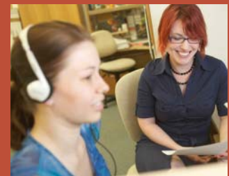
Library staff recording a podcast.

Look for the Podcasts@your library logo on the University Library home page at library.curtin.edu.au