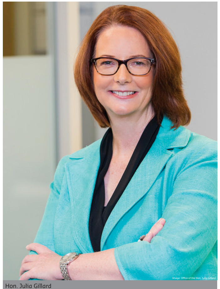
Hon. Julia Gillard

Visit the JCPML website for more information: http://www.john.curtin.edu.au/aboutus/patron_index.html