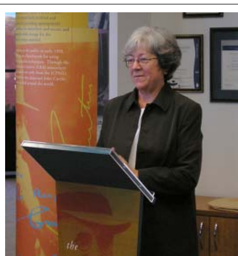
Dr. Carmen Lawrence, the current Member for Fremantle, officially launched the web resource on 19 February 2007.

The Federal Electorate of Fremantle: a history since 1901 is available at http://john.curtin.edu.au/fremantle/