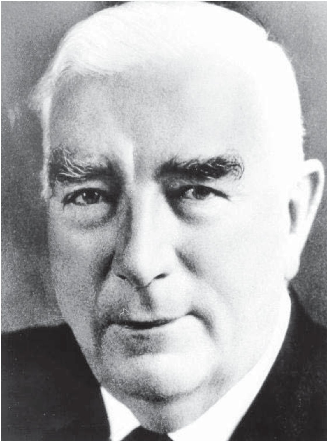
Prime Minister Robert Menzies, c. 1960. JCPML00036/11