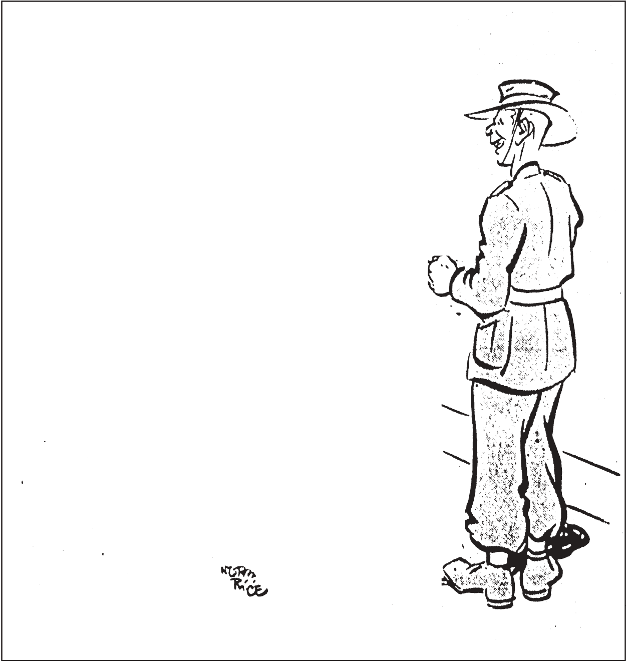
Published in the Bulletin , 23 December 1942