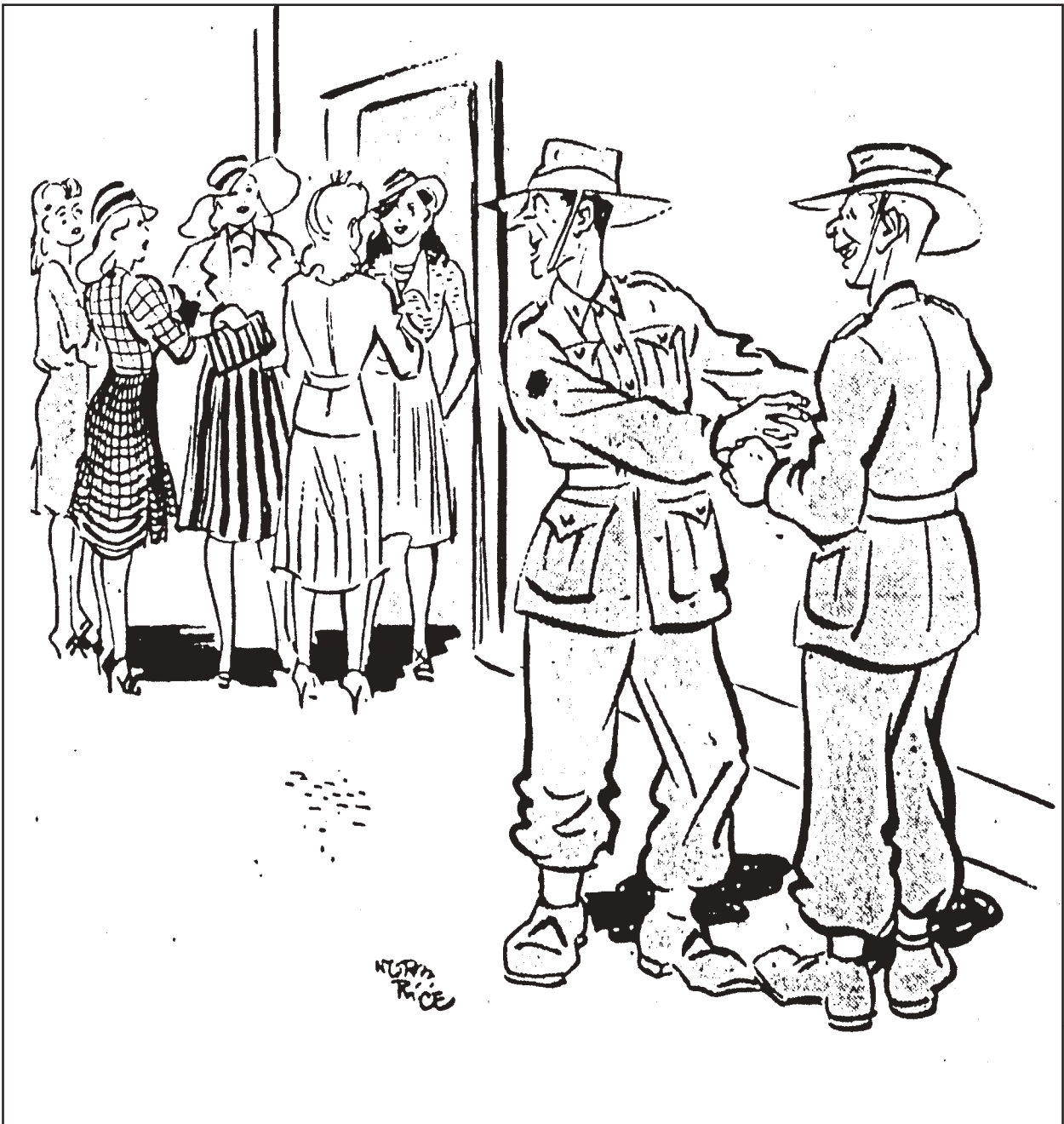
Published in the Bulletin , 23 December 1942