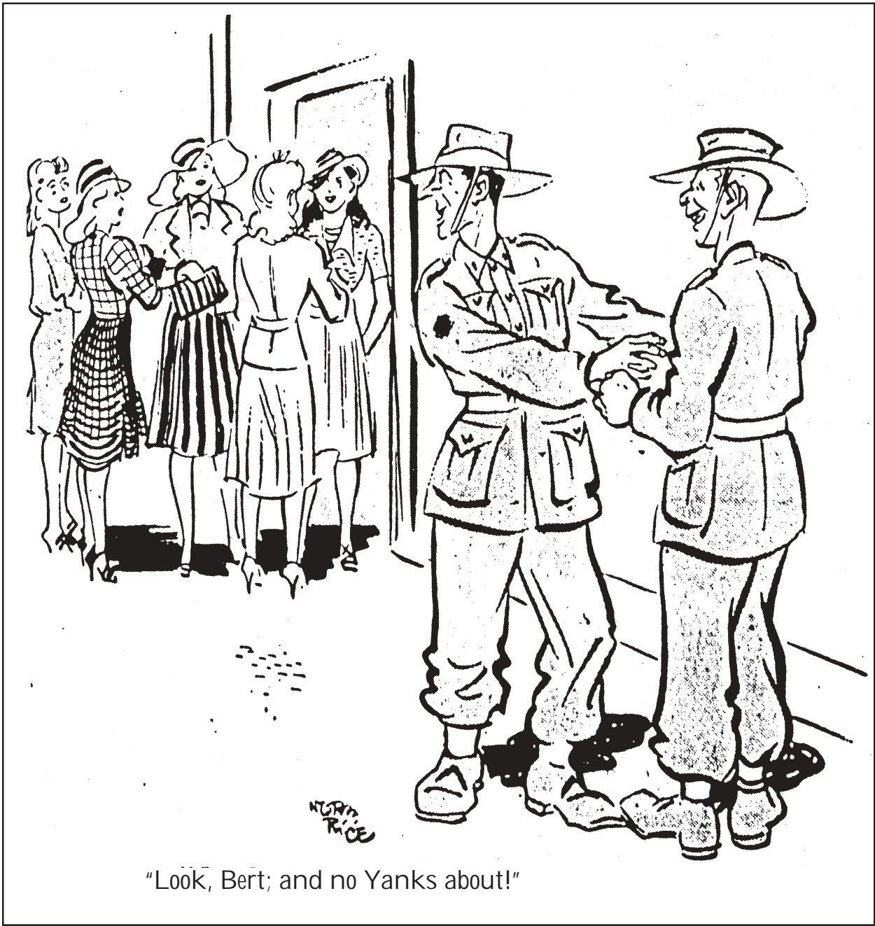
Published in the Bulletin , 23 December 1942